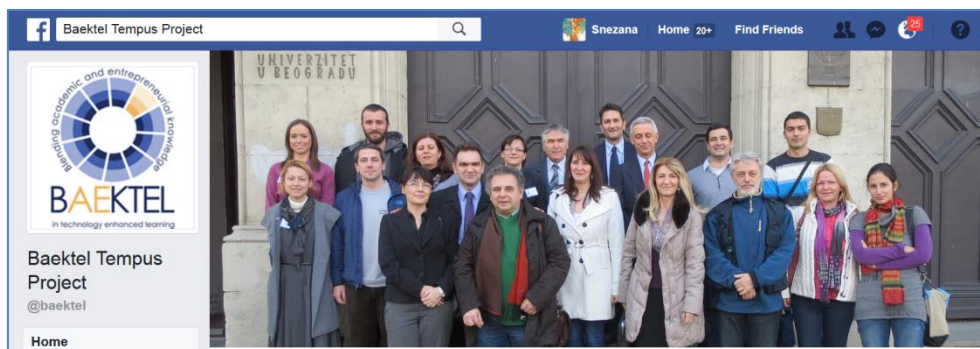
Figure 1 : BAEKTEL Facebook page ( https://www.facebook.com/baektel )

The project results are presented to wider community through papers and workshops at highly rated regional academic conferences, but also through various seminars and conferences for teachers, HE authorities, University management and enterprises. In the first part of project focus of dissemination activities was on presentation of BAEKTEL project and its goals to wider community. During second part of project main results of BAEKTEL projects - OER platform, Meta Data Portal Open Educational Resources as well as advantages of using technology enhanced learning in vocational and life-long learning were presented. Activities of DEV 6.4 are carried out throughout the entire duration of the project. Detailed list of activities is shown in Table 1. BAEKTEL project and results were disseminated through YouTube channel, Facebook and Twitter. Social media widgets (Facebook, Twitter) are used for online dissemination of project. During project lifetime all news and relevant information about project activities are published on BAEKTEL Facebook page ( https://www.facebook.com/baektel ) and BAEKTEL Twitter page ( https://twitter.com/BAEKTELProject ).